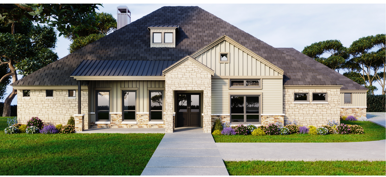
Home rendering disclaimer: Colors and selections in the home renderings are subject to change. Please contact us for more information.