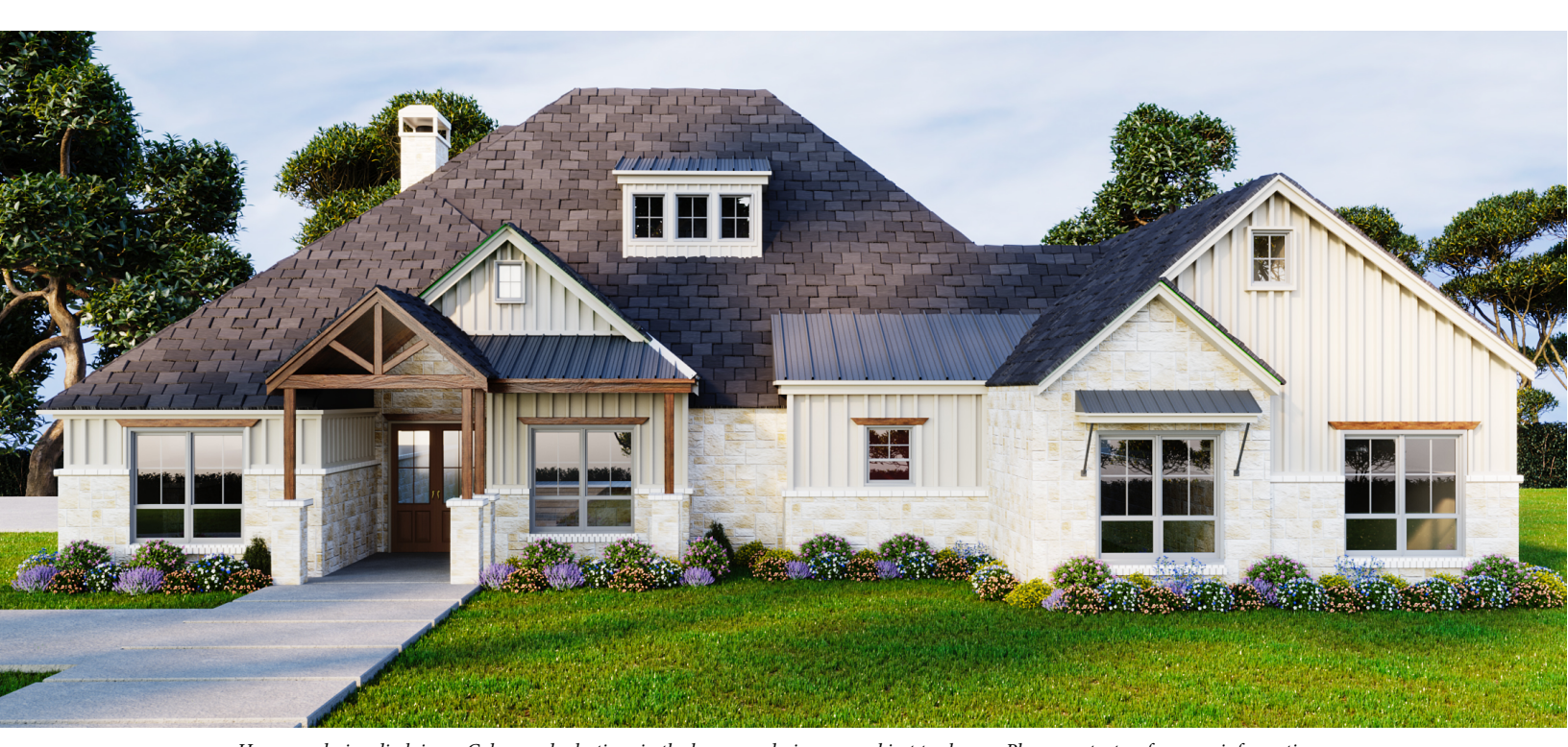
Home rendering disclaimer: Colors and selections in the home renderings are subject to change. Please contact us for more information.